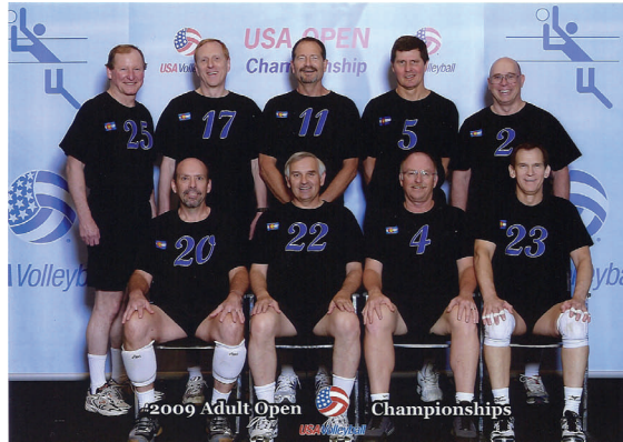
COLO MASTERS 55s