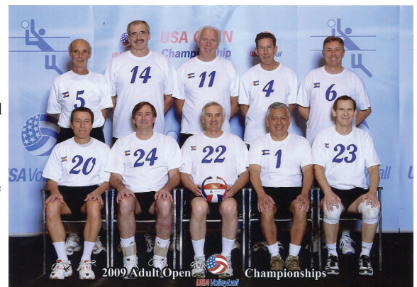
COLO MASTERS 60s